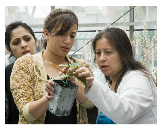
California State University, Los Angeles

Do students and faculty members work together on committees and projects outside of course work? 57% of FY students at least occasionally spent time with faculty members on activities other than coursework.